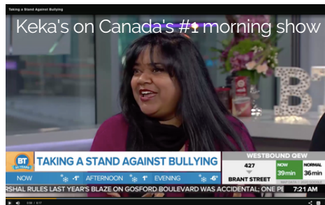
Keka's on Canada's #1 morning show