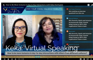
Keka: Virtual Speaking