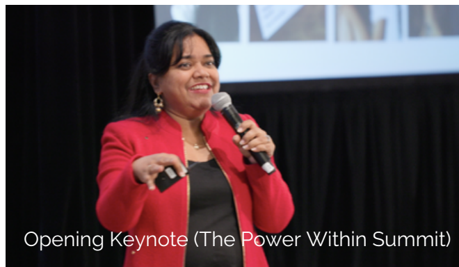
Opening Keynote (The Power Within Summit)